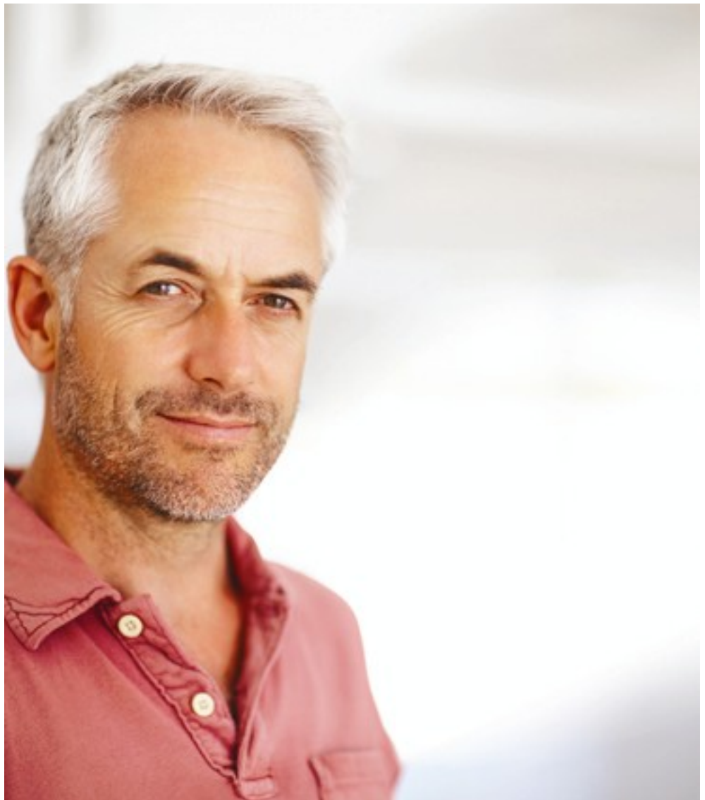
The aches and pains that often accompany the aging process can be managed with bodywork.

Aging, obviously, is a process none of us can avoid. As Benjamin Franklin said, "When you're finished changing, you're finished." Turn the inevitability of aging into a positive process of change and let massage and bodywork help you along the journey.